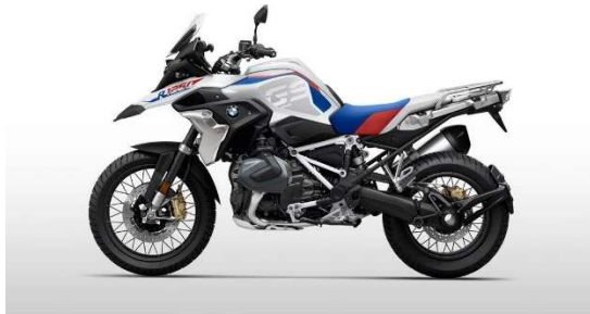
BMW R1300GS additional premium €1,000