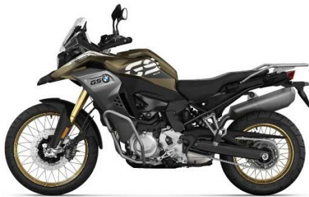
BMW F900GS additional premium €500